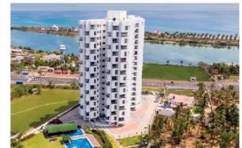
Ecstasea - ECR