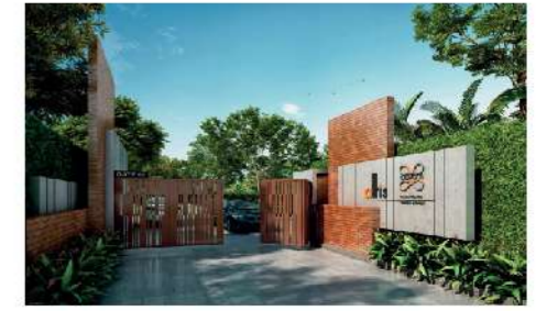
Aavaas - Tondiarpet