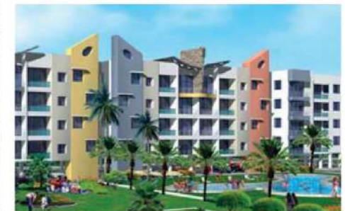
Sky City - Vanagaram