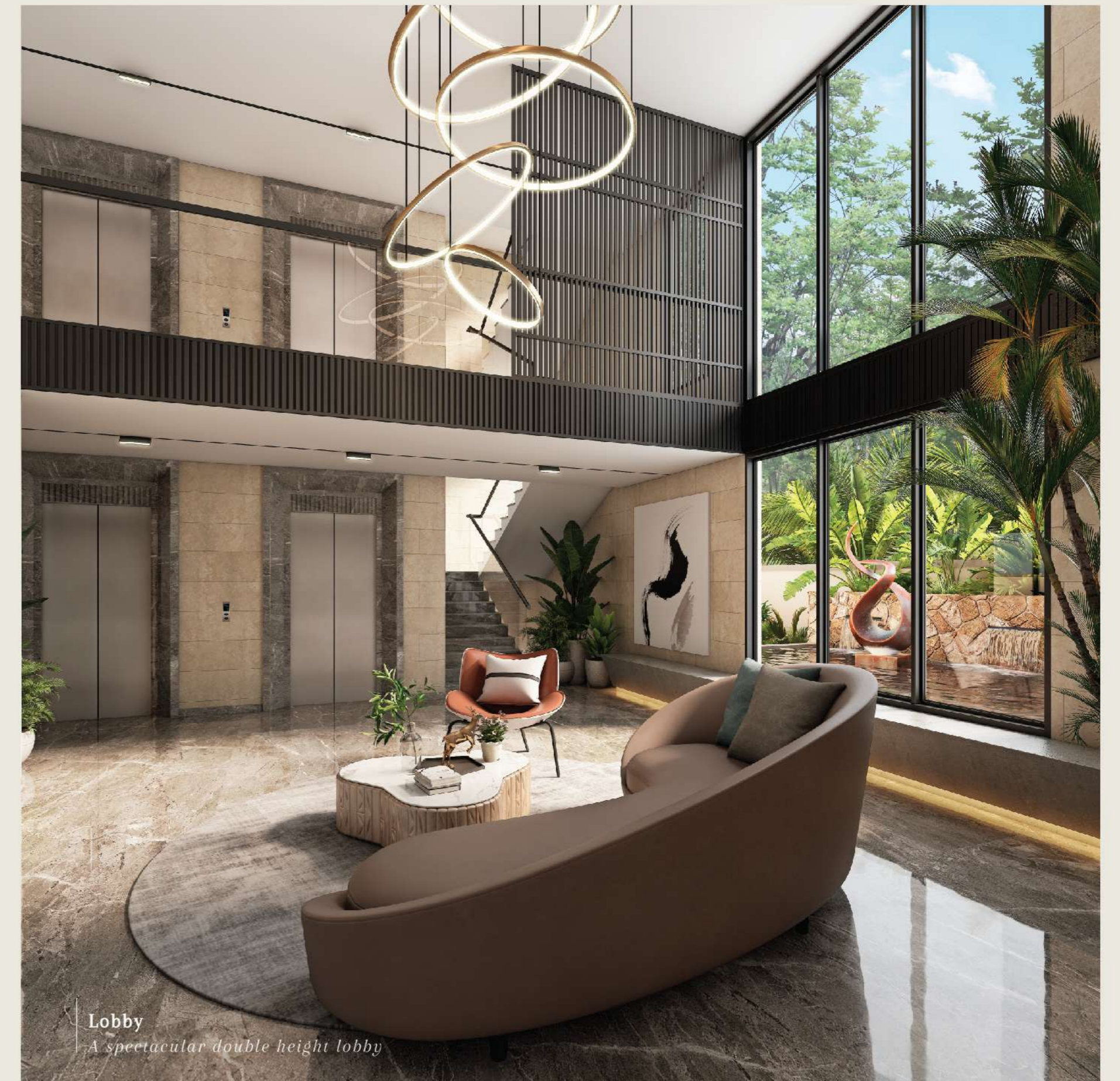
Lobby A spectacular double height lobby

The façade's clean lines give it a contemporary flair. Flanked by a double height entrance lobby that imposingly magnifies the first glance entry experience, this spacious setting with access to dual elevators imitates the vibes of a five-star property.