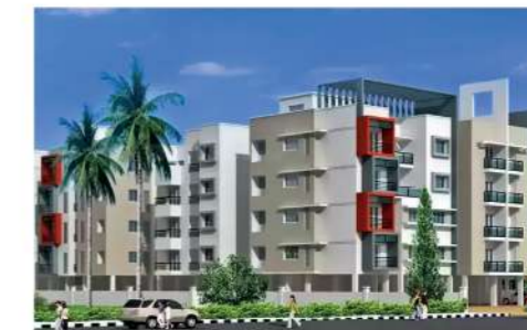
Urbanville - Velachery