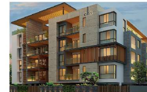
Sri Lakshmi Vilas - Kotturpuram