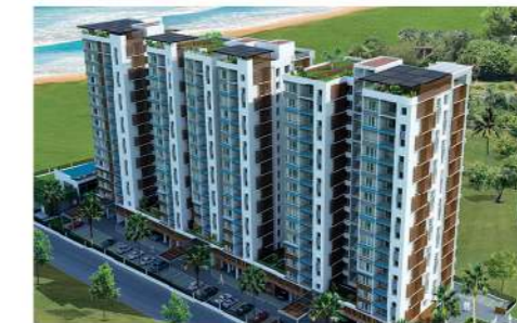
Oceanique - ECR