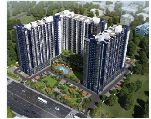
Ashraya - Mangadu