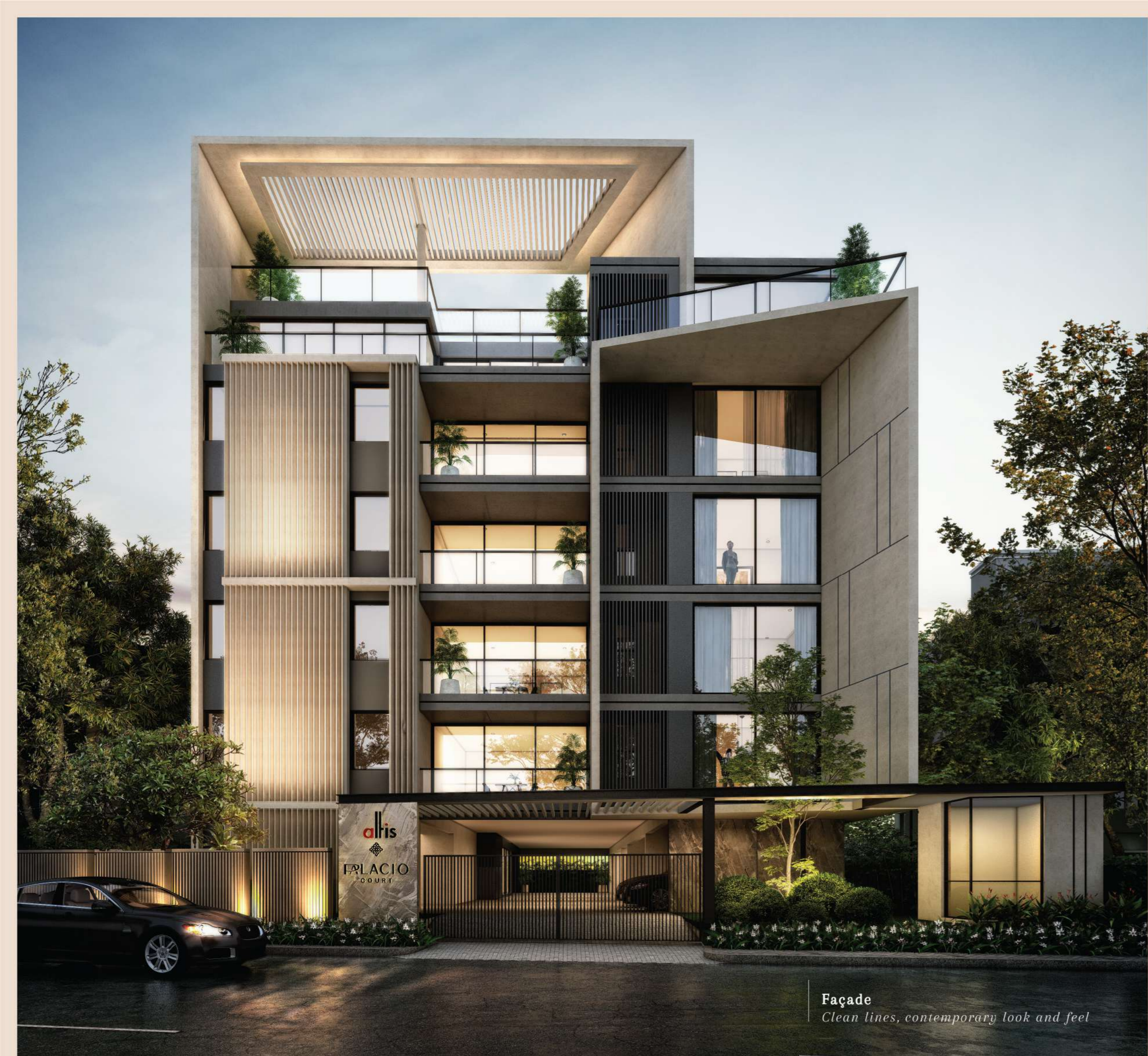
Façade Clean lines, contemporary look and feel