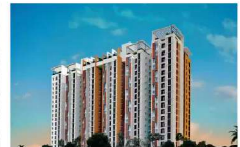
Horizon - Saligramam