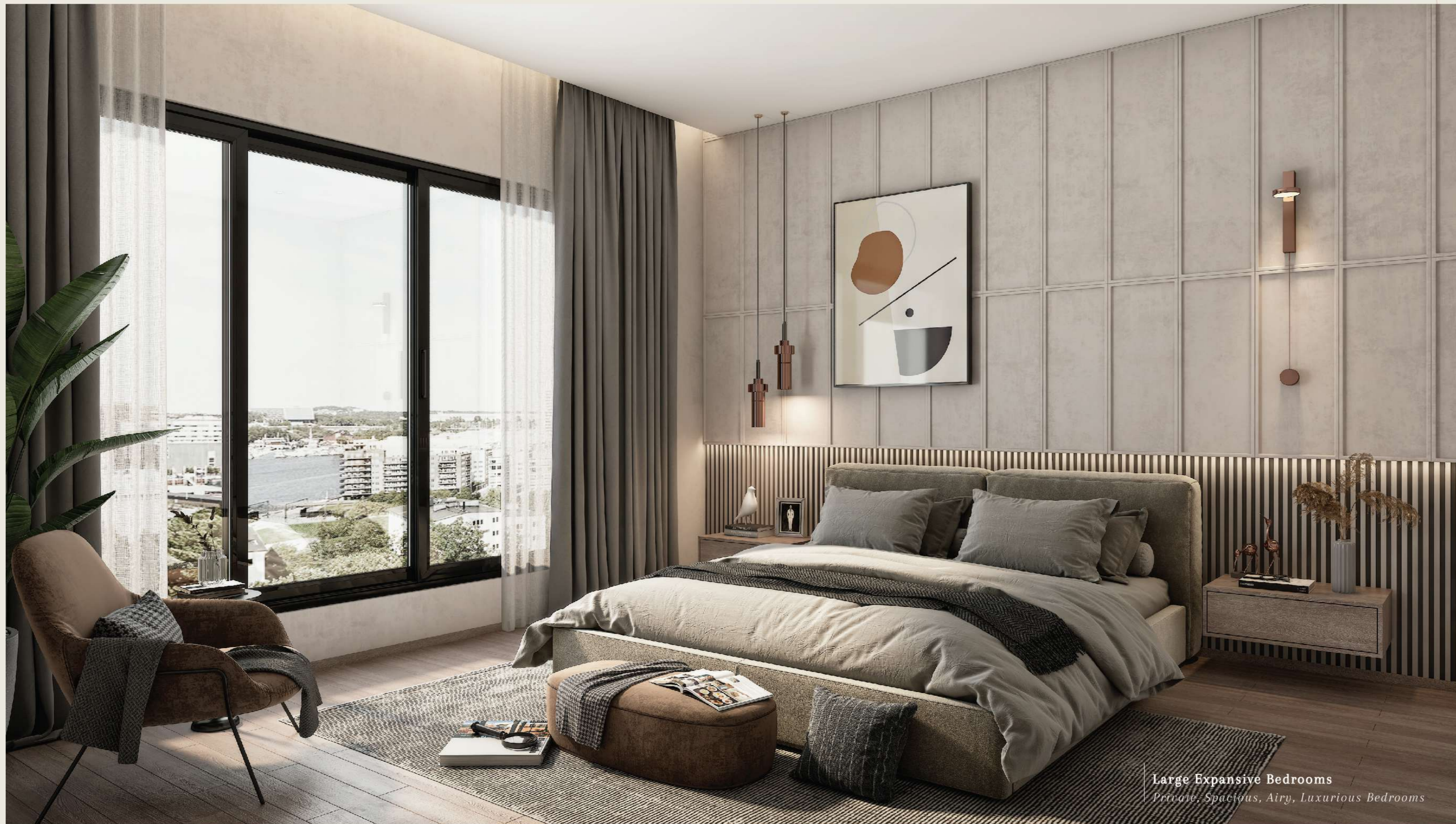
Large Expansive Bedrooms Private, Spacious, Airy, Luxurious Bedrooms