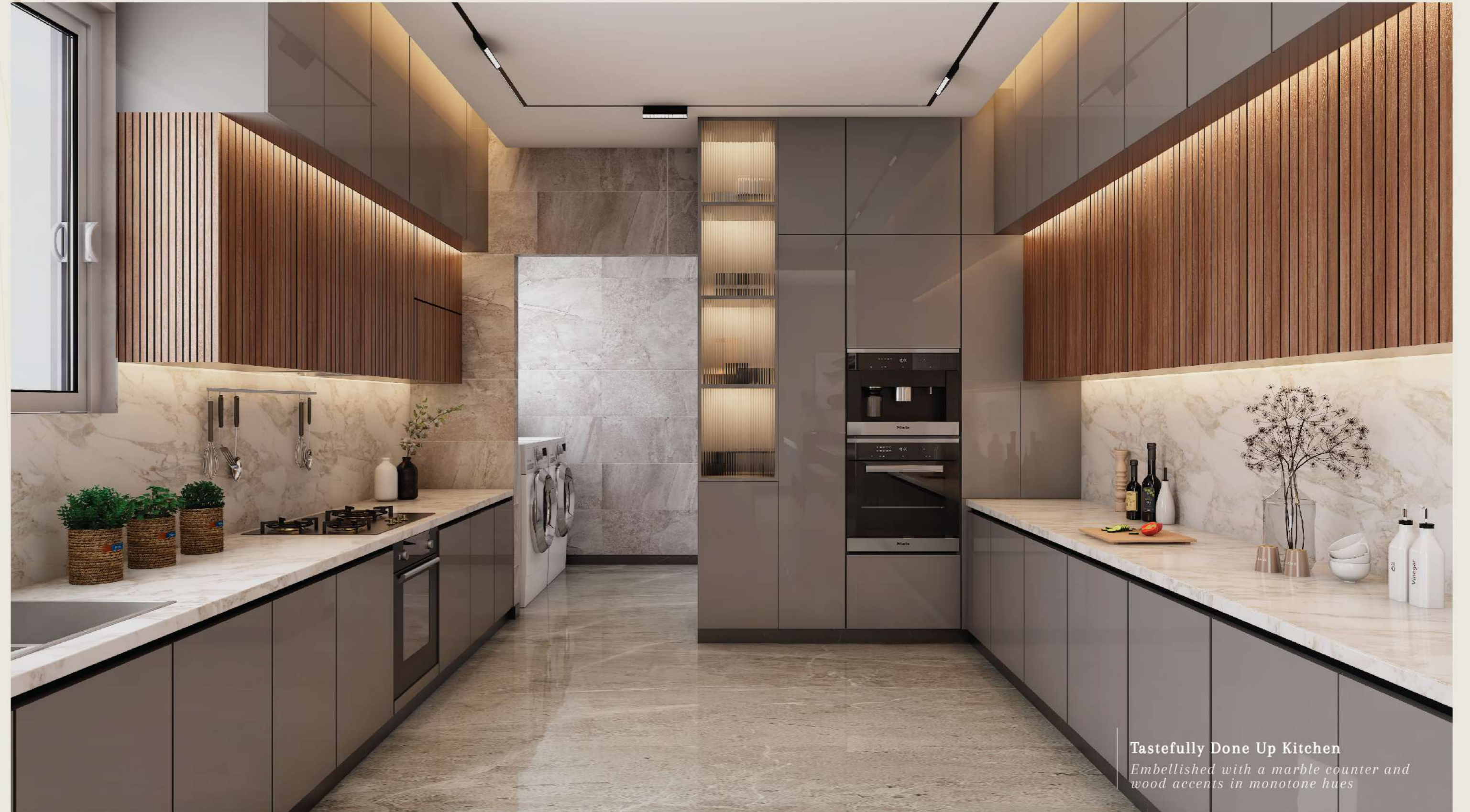
Tastefully Done Up Kitchen Embellished with a marble counter and wood accents in monotone hues

The inviting kitchen has a seamless white marble counter as a centrepiece with tasteful wooden elements that will bring out the latent chef in you.